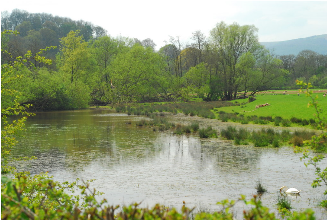
Figure 1 Classic Oxbow Lake by John Winder